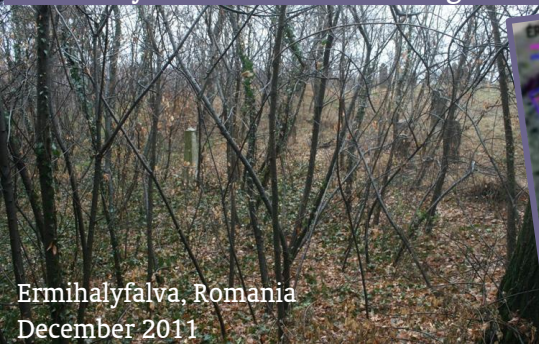
Ermihalyfalva, Romania December 2011